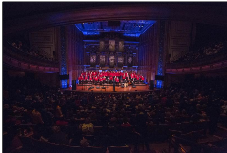
Boston Children's Chorus, 13 th Annual Dr. Martin Luther King, Jr. Tribute Concert: Raw Truth

First-time attendees to a given chorus's programs are more likely than frequent attendees to cite social motivations, especially "because someone invited you" and