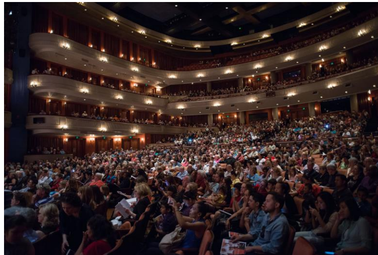
VocalEssence ¡Cantaré! Concert, 2015

Most significantly, the two indicators of Social Bridging and Social Bonding outcomes were found to move together. Programs that trigger one tend to trigger the other.